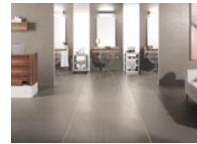
interiors 2011 at NEC, Birmingham