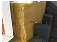
Presenting the best of the interiors industry...