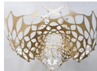
Hi-Macs flying high